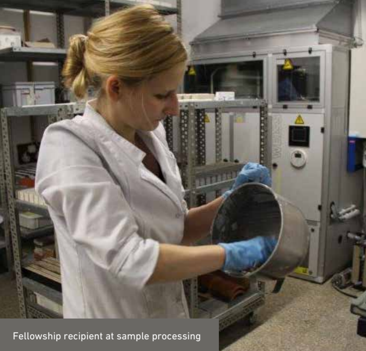
Fellowship recipient at sample processing