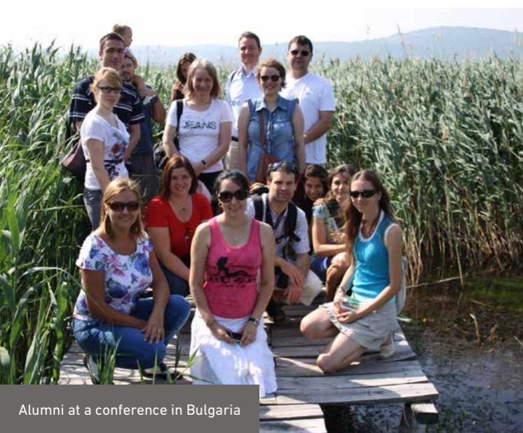
Alumni at a conference in Bulgaria

DBU coaches its fellows during the whole stay. During seminars the fellowship recipients can present their topics and their results and network with each other. Furthermore, DBU welcomes and supports individual initiatives to organize further professional events and seminars.