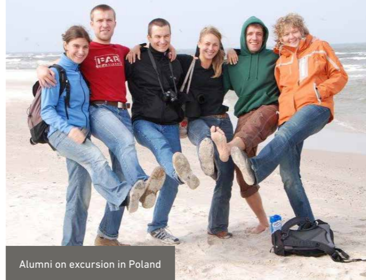
Alumni on excursion in Poland

During the fellowship practical solutions for current environmental issues are developed. After their stay in Germany the alumni are well qualified to tackle these issues in their home countries thus assuring efficient knowledge transfer. Working closely together in an international context helps to breakdown existing barriers. The acquired contacts will create a strong network of highly committed environmental experts.