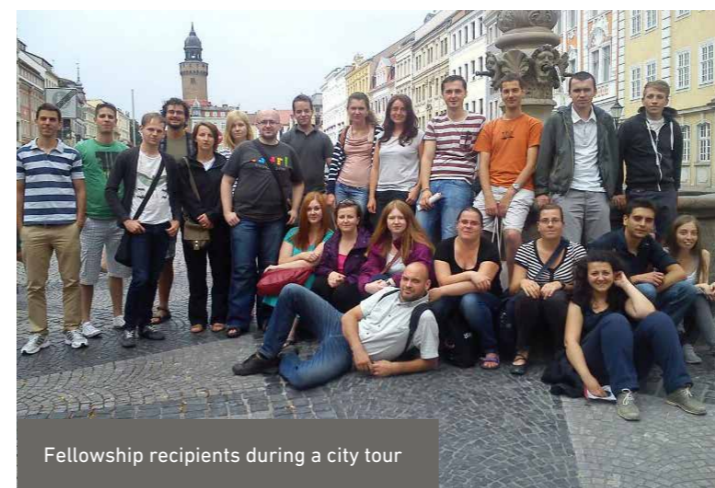
Fellowship recipients during a city tour